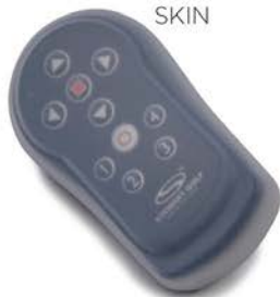
SILICONE HANDSET SKIN