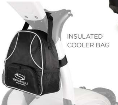
INSULATED COOLER BAG