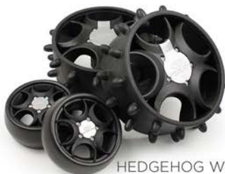
HEDGEHOG WET WEATHER WHEELS